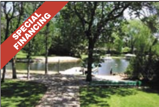
Cape Cod Lake Front... 3bd/2ba; lake front charm; vaulted ceilings; open, bright; large master suite; sun room; private beach & dock; private setting; golf cart garage; relax and swim. (MLS# 1026411) $90,000