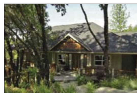
Remarkable New Custom European Styled Architectural Gem... 3bd/2.5ba; highly designed; unlike anything you'll likely see in Nevada Co.; estate quality in every way without estate pricing. (MLS# 1026097) $750,000