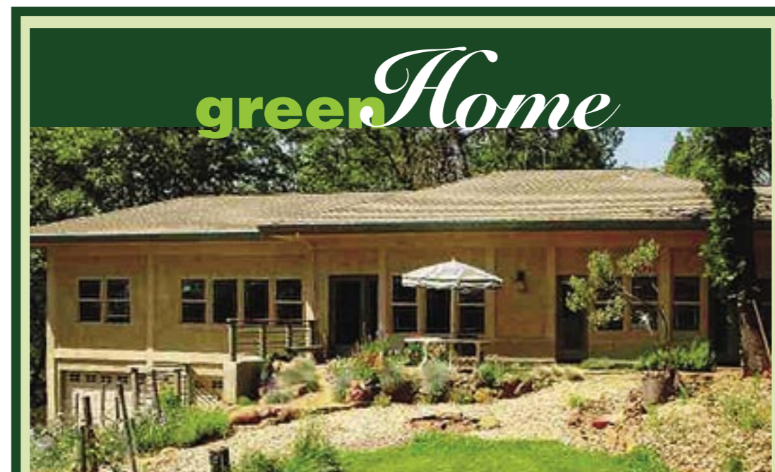
Alta Sierra Sanctuary for Body and Soul... 3bd/2ba; experience technology that returns us to simplicity—natural lighting, passive solar heating, natural cooling, the warmth and endurance of wood and stone coupled with state of the art design built to provide optimal health; offering superb indoor air quality and peaceful ambience; this home was twice featured in The Union and once in the Auburn Journal . See all the details of this environmentally sensitive green home by visiting the owner's web site at www.grassvalleygreenhouseforsale.com such as it's steel framing, programmable central ventilation system, energy conserving passive solar house design which has minimal costs for cooling and heating. (MLS#1024319) $665,500