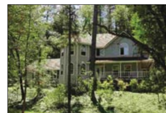
Charming Country Home... 4bd/3ba; on a tranquil 5 acre setting; very spacious, huge master suite with room for an office area; living room, family room, formal dining room. (MLS# 1025689) $599,000