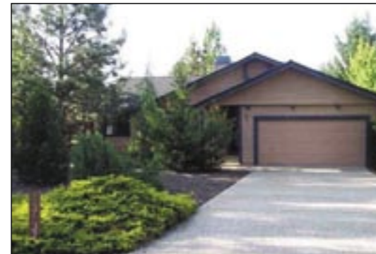
Level, Move in Condition... 3bd/2ba; newer 40 yr. comp roof; HVAC, carpet, water heater; covered 230 sf back deck (could be enclosed for more space) overlooking lg. level back yard. (MLS# 1025496) $429,000