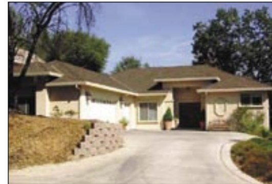
Custom Built in 2004... 4bd/3ba; quiet & private; oversized corner lot; gourmet kitchen w/upgraded cabinets & walk-in pantry; lg. deck off lvg. rm. w/gas to BBQ; oversized garage. (MLS# 1022618) $788,000