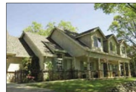
French Country Estate... 4bd/4ba; located on 9.5+ private gated acs. w/wildly pond; 3100+/- sf knoll top home w/long range views; 2000 sf +/- shop w/attached office & 1bd/1ba guest house @ 1000 sf (MLS# 1026376) $850,000