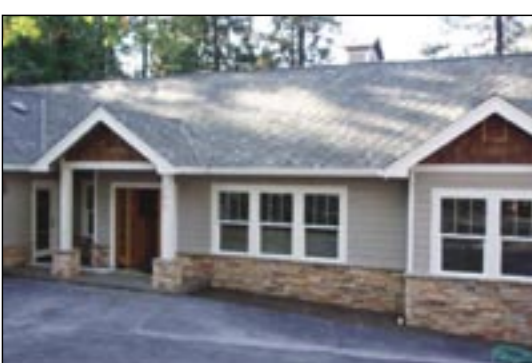
Captivating View Of Year-Round Wolf Creek... 3bd/3ba; once inside this home you feel total privacy; perfect location; neighborhood supports value; close to shopping. (MLS# 1026322) $795,000