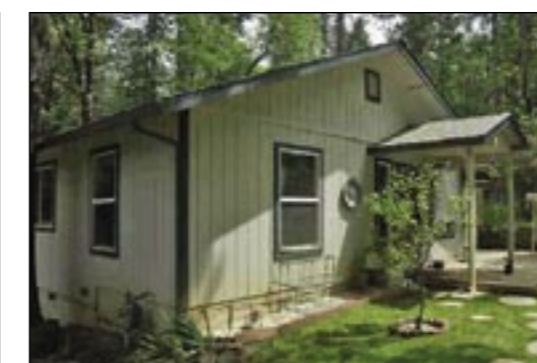
On Exceptional Lot... 4bd/2ba; only 5 yrs. old; in neighborhood of $900,000 homes; lot has room for gardens/pool; great rm. floor plan opens to generous kitchen; lg. rms. w/lots of light. (MLS# 1026244) $395,000