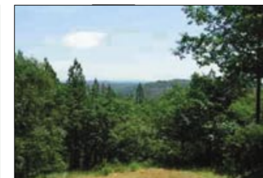
Gorgeous View From Back Deck... 2bd/2ba; 11 acs.; located in an exclusive million dollar neighborhood; property has plenty of potential & room to expand & create your dream home. (MLS# 1025921) $479,000