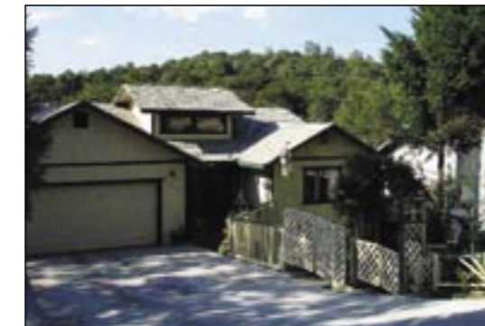
Space & Privacy... 5bd/3.5ba; in-home theatre, library, game rm. + lvg. rm., 5 bdrms. & office also a "granny-like" downstairs; 4 decks & seasonal creek running through back yard! (MLS# 1026824) $745,000