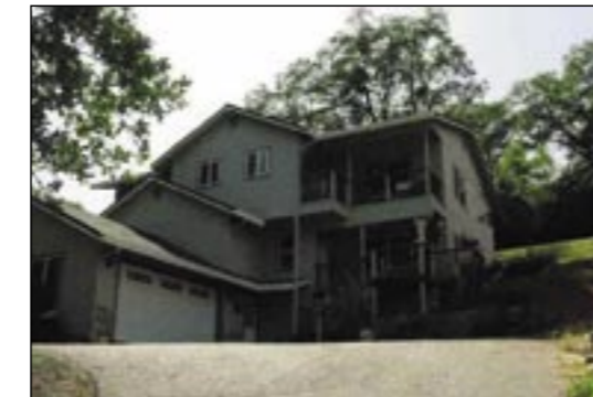
Newer Multi-Level Home... 3bd/2.5ba; main living upstairs; private balcony; spacious w/open floor plan, vaulted ceilings, beautiful color schemes, decorator touches. (MLS# 1025384) $414,500