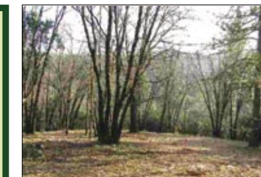
Dramatic Property Close to Nevada City... recent brushing has opened beautiful bldg. site; nice local views w/sense of privacy; great tree cover w/spectacular rock outcroppings. (MLS# 1024652) $199,500