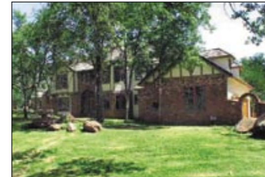
Perfectly Set On 41+ Gorgeous Acres... 3bd/4+ba; views of snow capped mtns.; custom crafted 4,000+/- sf estate; beautifully appointed baths; 20 ft. ceilings, custom room moldings thru out. (MLS# 1025233) $2,100,000