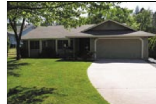
Inviting Hideaway On Quiet Cul-De-Sac... 3bd/2ba; ready to move in with new updated appliances in kitchen, private deck with hot tub, spacious master bedroom. (MLS# 1025711) $479,000