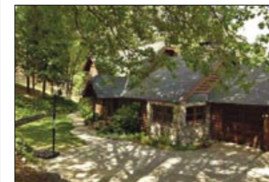
Lovely "Log" Home with Local Views... 3bd/2 ba; very private; seller is moving out of state; master is a retreat with a wood stove and wonderful views. (MLS# 1025985) $499,000