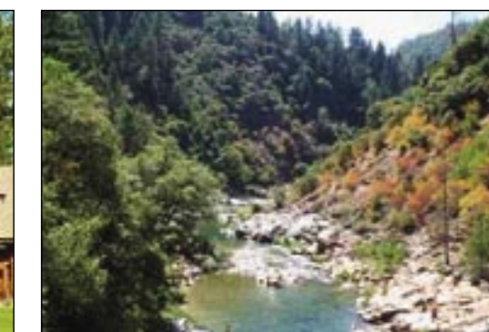
10 Wow Acres! ... level, gently rolling; usable lush tall trees.; 6 mi./6 min. to Nevada City; near Yuba River; recent clearing; many bldg/dev possibilities; views to Yuba River Valley/Sierras. (MLS# 1026484) $299,000