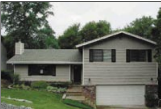
Immaculate Split Level... 3bd/2.5ba; on golf course; you'll love it the moment you step inside; newer roof & 500 sf of newer deck; remodeled master bath; fresh paint inside & out. (MLS# 1024377) $474,900