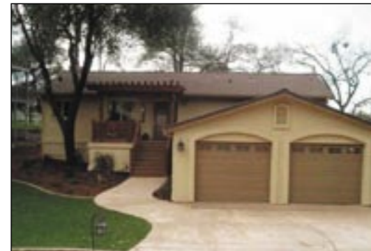
Wow! Looks Like a New Home... 3bd/2ba; stucco exterior; recently remodeled; gourmet kitchen w/granite counters & tile floors; stainless steel appl.; cathedral ceilings & fireplace in lvg. rm. (MLS# 1024406) $520,000