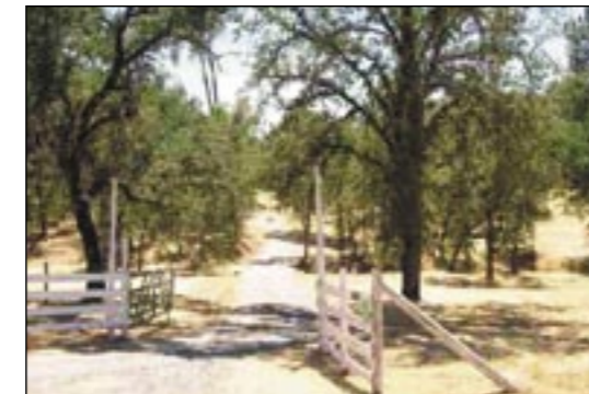
Beautiful South County Location! ... 24+ acs.; commuter friendly & conveniently located; potential vineyard or gorgeous horse property; well in; septic in; ready to build; 30 x 60 steel barn; 1/2 +/- ac. pond. (MLS# 1026930)