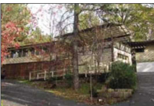
Vast Covered Decking for Indoor/Outdoor Living... 3bd/3ba; vacant contiguous lot included; has septic system for adjoining house. (MLS# 1026359) $449,000

Serving Grass Valley • Alta Sierra • Chicago Park • Peardale • Surrounding Areas