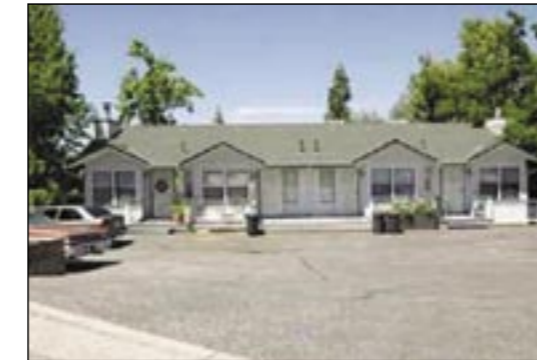
Nice 4-Plex... all 4 units are 2bd/1.5 ba; tucked away in heart of dwn.; no vacancy & apts. rent quickly; each unit boasts its own washer/dryer, small backyard & deck (MLS# 1026588) $615,000

The information on this supplement is from varying sources. Neither the brokers nor the agents nor the Nevada County Multiple Listing Service have verified it.