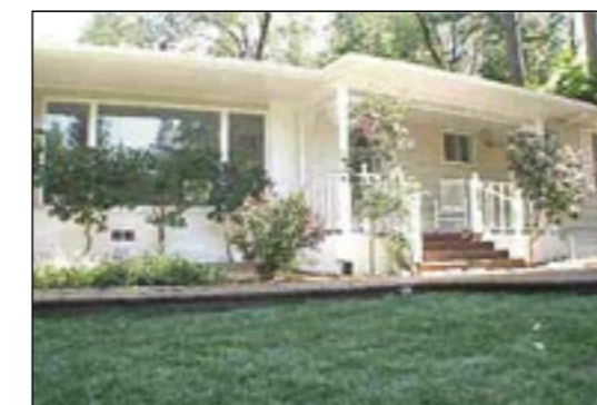
1-level Living... 3bd/2.5ba; mature landscaping & big trees; prvt. back yard perfect for pool, spa, outdoor living; kids can walk to school; close to everything; on quiet loop road. (MLS# 1026853) $469,000