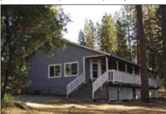
Charming Newer Country Style Home... 3bd/2ba; on 3.4 acs., private & usable; many extras; 1,200 sf garage/shop; large covered front deck (ironwood); hard-plank siding; skylights. (MLS# 1024769) $499,900