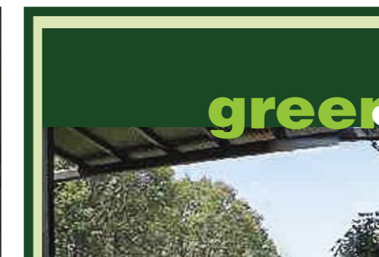
Exceptional 2004 Custom Craftsman Green Home... 3bd/2ba; spacious open feel; 5.83 private acres boasts spectacular views, solar power plus PG&E reverse meter, organic gardens, separate 1,340 sq. ft. workshop and more. National Forest high country; just 12-15 minutes above Nevada City and 3 miles off Highway 20 East. Custom builder designed particularly for energy efficiency, using environmentally sustainable materials in his unique craftsman construction. With builder's discerning eye for environmental aesthetics, he set this invitingly natural home standards apart from the several neighboring million-dollar properties. (MLS#1026971) $698,500