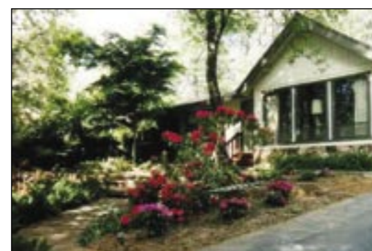
Well Maintained Sherwood Forest Home... 3bd/2ba; shows pride of ownership; lg. lv. rm. has vaulted beam ceiling; nicely landscaped back yard is great for entertaining. (MLS# 1026331) $495,000