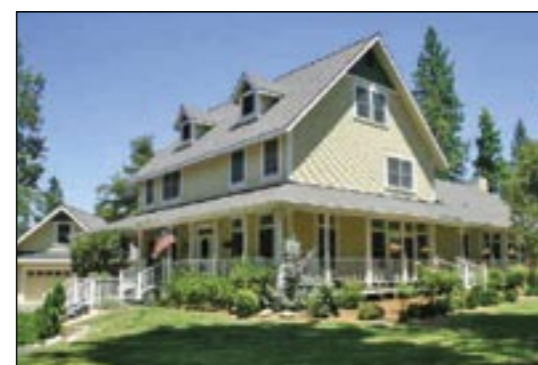
This Is Your Dream House! ... 4bd/3.5ba; elegance, style & grace surround this exceptional estate sited on 7+ prvt. acs.; on gated gentle knoll w/panoramic views; wrap-around decks. (MLS# 1026297) $1,250,000