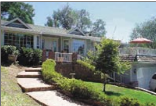
Open & Bright... 4bd/3ba; beautiful brick pathways; lg. kitchen open to fam. rm. w/eat-at counter & cozy breakfast nook area w/bay window; fam. rm. has French doors leading to beautiful spacious deck. (MLS# 1026913) $500,000

10193 Combie Road • Just past Longs Shopping Center Serving Lake of the Pines • South Nevada County • Auburn • Colfax • Meadow Vista • Surrounding Areas