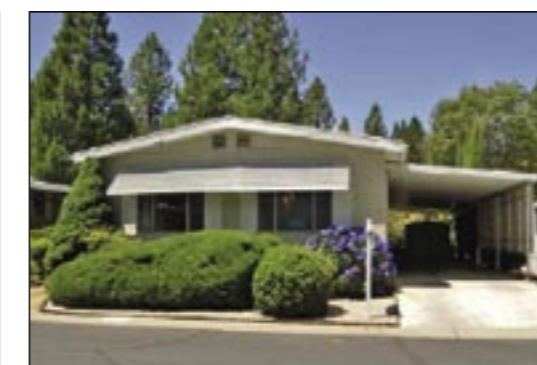
Spacious Mobile in Forest Springs Mobile Home Park... 2bd/2ba; open design on a great lot with nice landscaping and a secluded back yard; light filled floor plan. (MLS# 1026282) $86,000