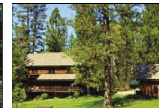
Luxury in the Country on North San Juan Ridge... 3bd/2ba; gorgeous craftsman; 2,800 sf on 2.87 acs.; 3,000 sf workshop; in-law apt.; barn, corral, pond; www.rustic-luxury-home.com (MLS# 1025235) $914,000