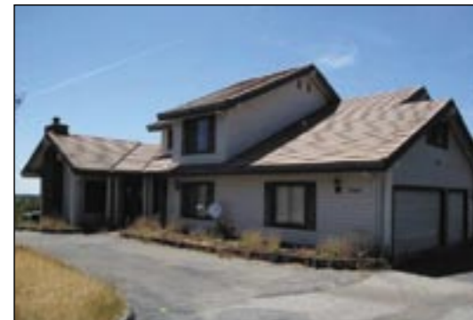
Clipper Gap Beauty... 5bd/4.5ba; 4.2 acs. with scenic views off back porch; 2-car attached garage; gas fireplace. (MLS# 1026635) $884,900