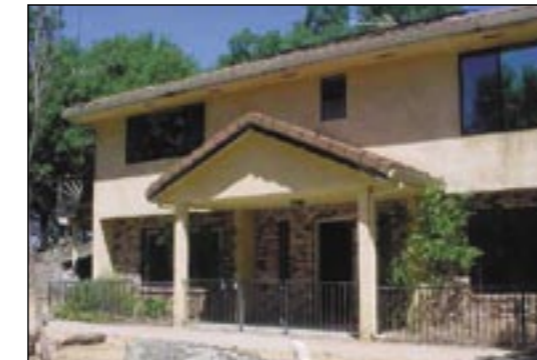
Great Potential Here! ... 3bd/2.5ba; passive solar designed home in great area; prvt. setting suitable for horses; lg. fam. rm.; nice in-ground pool w/pool house; oversized 2-car garage. (MLS# 1026753) $585,000