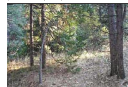
Great Neighborhood... one half acre; Peardale area; minutes to town with easy access to I-80 and Hwy. 49; NID ditch behind property. (MLS# 1026129) $187,500