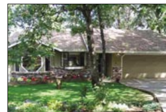
Charming! ... 4bd/3.5ba; on quiet street w/primary lvg. on main floor; 2 bds, bath & family rm. on lower level; vaulted ceilings, skylights & built-in china cabinet; lg. area w/pad for R.V. prtg. (MLS# 1026163) $480,000