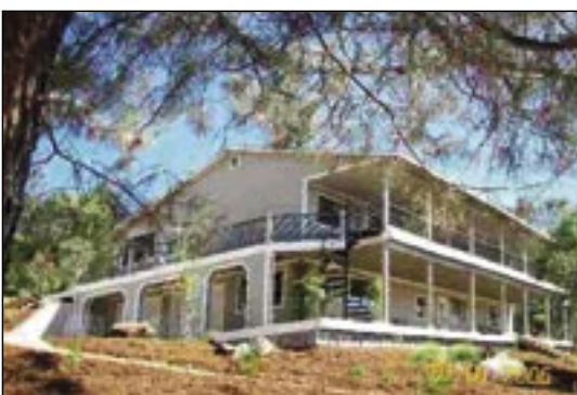
Top Of Knoll Privacy... 3bd/3ba; sunsets & pano views to Sutter Buttes from 2 lg. covered decks w/fans; remodel w/cherry wood cabinetry & floors, granite, appliances, carpet, tile, much more! (MLS# 1025747) $715,000