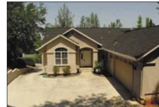
Space, Elegance, Great Design! ... 4bd/3ba; built in '04 feels & looks brand new; 1st floor foyer enters into great rm. w/gas fireplace, frml. dng. area, beautiful distinctive kitchen w/breakfast nook. (MLS# 1026450) $579,000