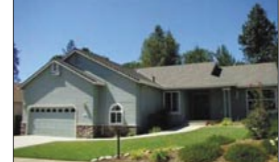
Impeccably Maintained... 3bd/2ba; finished garage w/extra storage space; permitted extra rm. can be used for office/bdrm.; carpeted bdrms.; tile floors in bathrooms; hrdwd. floors cover the rest. (MLS# 1026924) $515,000

Serving Grass Valley • Alta Sierra • Chicago Park • Peardale • Colfax and Surrounding Areas