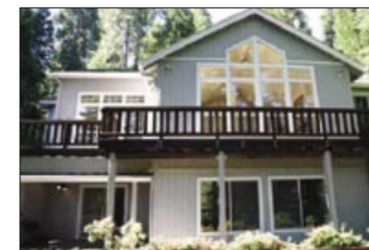
Quality Throughout... 3bd/4+ba; woody & prvt. w/rtn. views; lots of light; features newer guest area dnstrs.; newer carpets + hrdwd floors refinished; huge deck w/view of mtns. (MLS# 1026185) $769,000

Serving Nevada City • San Juan Ridge • Surrounding Areas