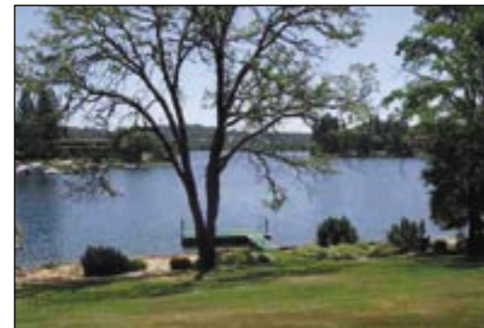
Gorgeous Lake & Marina Views... 4bd/3ba; lake front home; walk to beach, clubhouse, tennis courts, pool & golf course; fish & swim off your own boat dock; open floor plan. (MLS# 1026938) $1,070,000