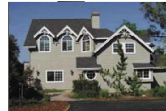
Remarkable, Highly Stylized Modern Home with Victorian Styling... 3bd/2ba; contemporary overtones & modern floor plan are dramatized by the stunning panoramic long range views. (MLS# 1026746) $450,000