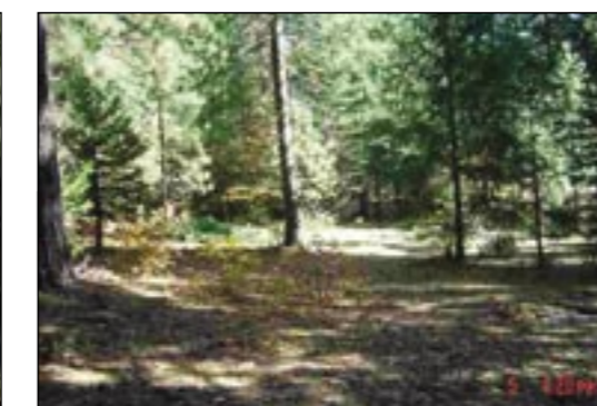
Enjoy Your Mountain Get-Away... located in Tahoe Nat'l Forest; 2.5 ac. lot completely fenced & all usable w/gentle upslope from front to back; 10 mins. to Nevada City & within minutes of Scotts Flat Lake. (MLS# 1023250) $279,900