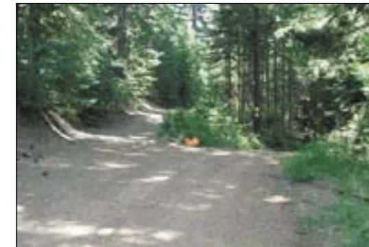
Sawtooth Ridge! ... 3 high country, legal parcels w/total of 122 acres of privacy; mostly level areas on all parcels; good access roads; great views of American River canyon. (MLS# 1026427) $279,900