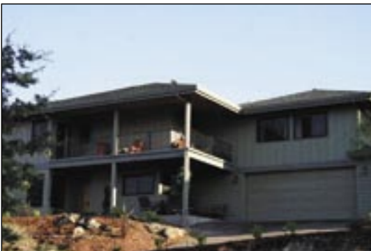
Custom Built with Views... 4bd/3ba; beautiful designer nicely appointed baths; lg. island kitchen w/ breakfast bar, concrete counter tops, custom cabinetry & large pantry. (MLS# 1026621) $665,000