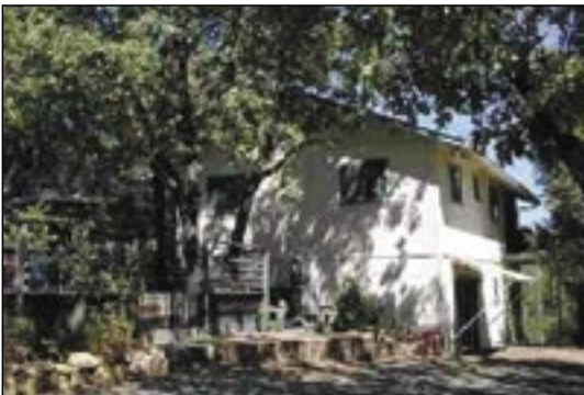
Wonderful Views of the Sierras... 3bd/2ba; sits back off road for privacy with a fenced in-ground pool, pool house with shower and toilet; great family home! (MLS# 1025857) $474,500