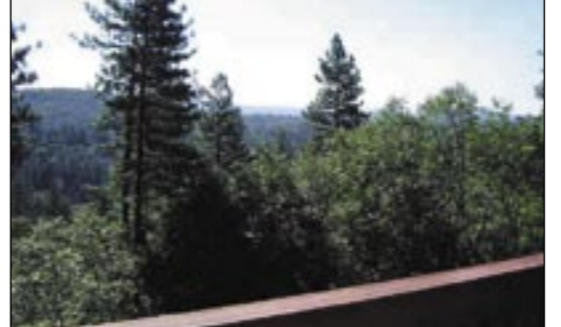
Panoramic Easterly Views! ... 3bd/2ba; lg. deck w/view for lvg. & entertaining; easy maintenance natural landscape w/trees; huge area for boat & RV w/electric & water hookup, etc.; shows like new! (MLS# 1026915) $425,000