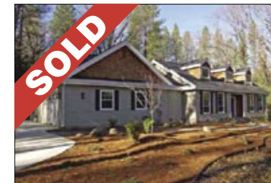
Enjoy Resort Living in the Sierra Foothills... 3bd/2ba; Cape Cod style home completed in 2006; on prvt. rd. w/walking/biking trails, seasonal creek & fabulous sunny, forested views. (MLS# 1024261) $775,000